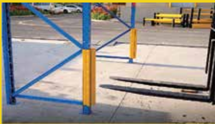
Impact RackShield working