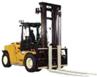
3. Forklift Truck