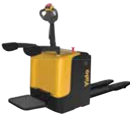
1. Pedestrian Truck