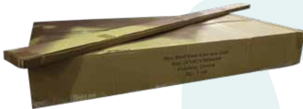
1 SET OF RACKING: 1 Set Of 1800mm Angle Upright & Racking Parts