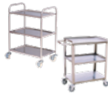
Stainless Steel Trolley - Handle