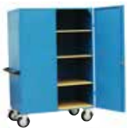
Steel Cabinet Trolley