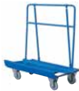
Trigonal Frame Trolley