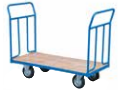
3 Way Side Netting Trolley