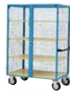
Netting Cabinet Trolley