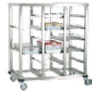
Medical Transport Trolley