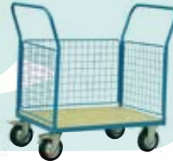
3 Way Side Netting Trolley