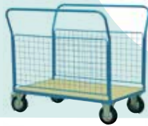
2 Way Side Netting Trolley