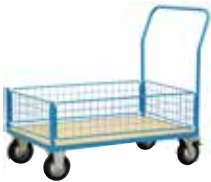
Low Netting Trolley